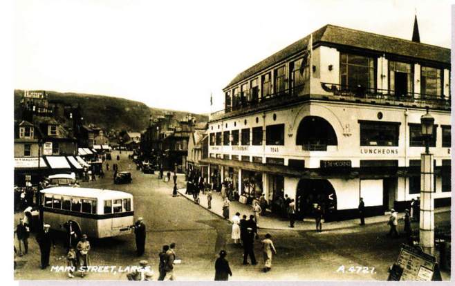
The Moorings and Main Street