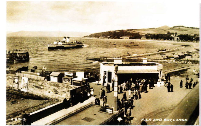
The pier and bay